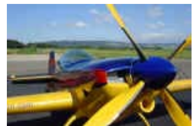
CZBA. The only things up in the air are our planes!

With any ownership change, there are issues that need to be addressed, and your patience through this time is much appreciated. The purchase of the Airpark and the enhancements currently underway and planned for the future are positive for our flying futures, and the investment we already have in the airport.