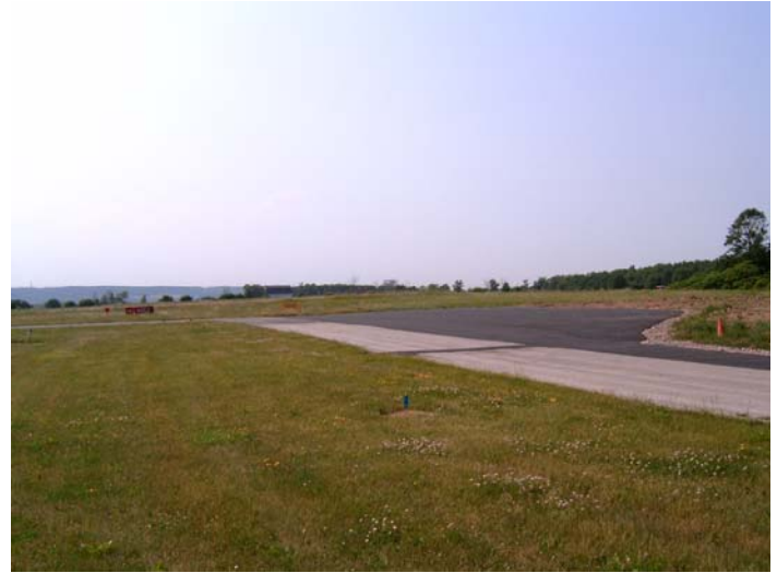
RWY 14 RUN-UP BAY