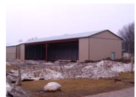
More work underway