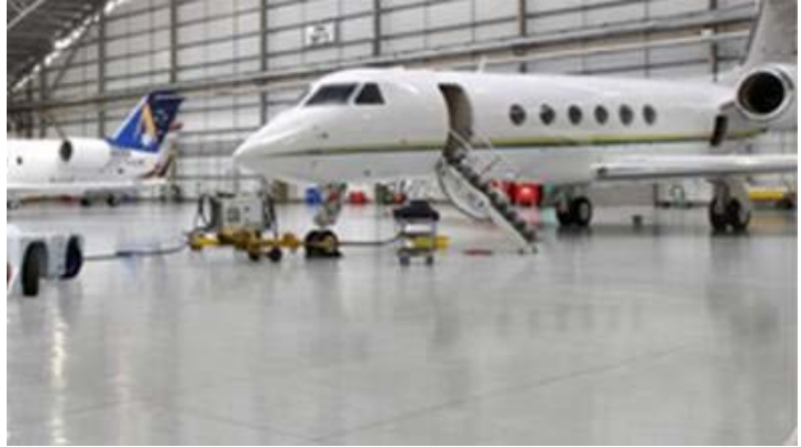
NOW THAT'S A HANGAR!