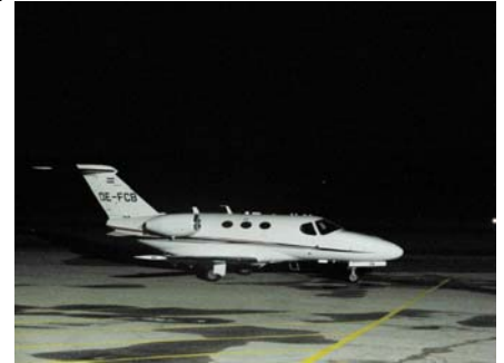
Cessna Mustang EnRoute via CZBA

If you have questions about this, please contact the office at 905 331 0075.