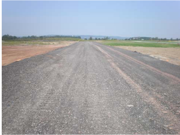
New laid out west taxiway looking north

As we continually expand to the west, please keep your eye on NOTAMs and other announcements relative construction.